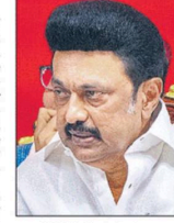
M.K. Stalin. File picture